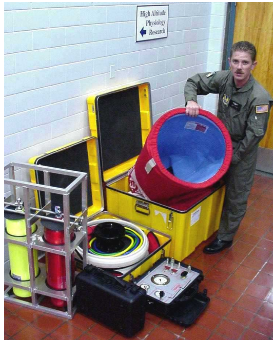
Fig. 2. Containerized EEHS and components

All the aforementioned tasks included a thorough inspection of the system at least prior to and following each challenge. Often, intermediate inspections were conducted during the challenge to assess pressure and integrity of the system to the challenge. Finally, to complete the assessment, and in compliance with PVHO-1 requirements, a free and unbiased inspection of the material quality assessment plan, manufacturing operations and quality control assurance was performed.