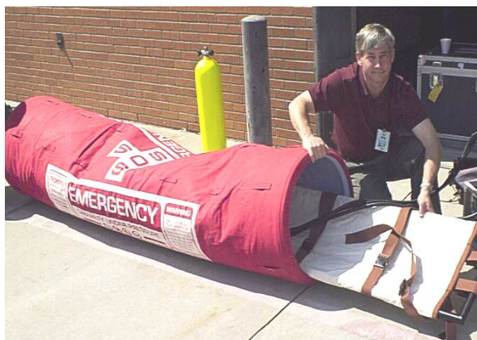
Fig. 3. EEHS Extended Ready for Patient Ingress

Finally, and an equally important adjunct to the static aeromedical evaluation tests mentioned above, was the airborne performance evaluations and analysis of the EEHS for placement, security, fit and function for several airframes. Principal among these evaluations included detailing methods for in-flight security of the system for safe travel and for emergency conditions including air turbulence and in-flight emergencies. Also, another important assessment of this task was to exercise the patient/operator communications issues in the noisy aeromedical transport environment. The comprehensive results of this evaluation are contained in a Technical Report composed by the executing agency (4).