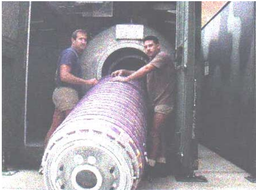
ILLUSTRATION A-3. GSE FLEXIBLE HYPERBARIC WILL NOT FIT INTO STANDARD U.S. NAVY DIXIE DOUBLE-LOCK CHAMBER.