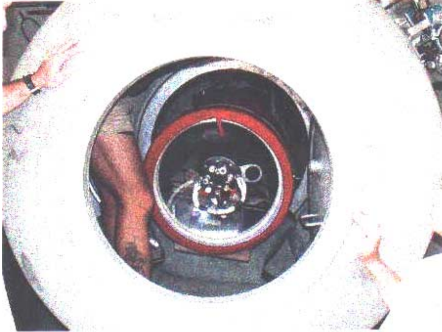
ILLUSTRATION A-4. HYPERLITE DOES FIT INTO U.S. NAVY DIXIE DOUBLE-LOCK.